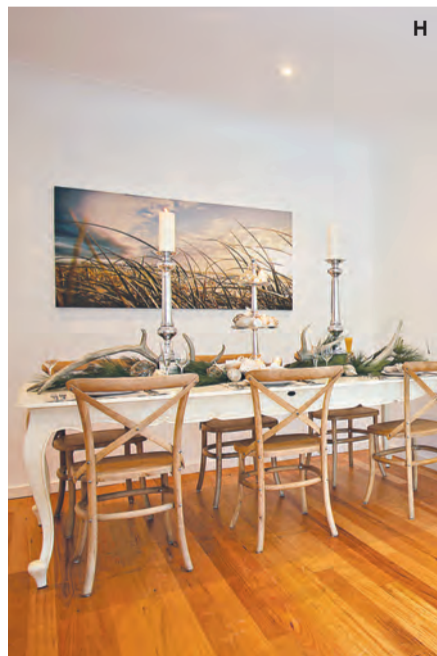
F The new kitchen was fitted with an island bench G The couple stuck with simple colours for broad appeal H A mixture of tones in the timber floorboards added warmth I Modern kitchen appliances were installed

The hardy floorboards suit Luke and Aime's love of the sand and surf –