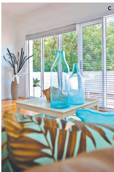
A The original house was in good structural shape B Aime and Luke Van Dyck C Light-filled rooms helped the couple achieve a beach feel D The exterior was rendered E Timber flooring is easy to maintain and suits a seaside lifestyle