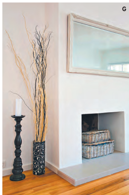
"We've gone for a modern beach feel but I didn't want super sterile clean lines, hence the mixed Australian hardwoods"